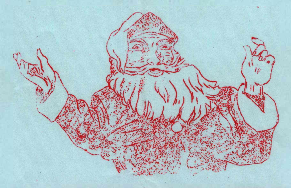
W. A. FREIBERG & COMPANY; Publishers of: BREVIZINE, ADVENTURE, THE BREVITY ANNUAL, FANTASY POCKETBOOKS GROUP, DAMSEL MAGAZINE ASSEMBLY

Truly your money can find no better investment than a year's subscription; your friend's will have no greater enjoyment. Before you lay this issue down send us $1.00 for each gift subscription, to 5369 W. 89th Street, Oak Lawn. Illinois. You'll be glad you did!